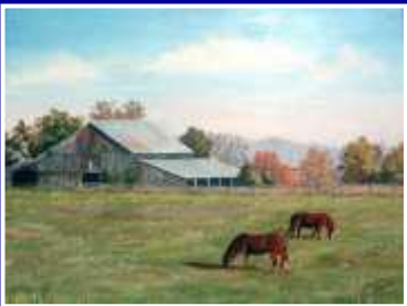
Original painting by Barbara Cocks