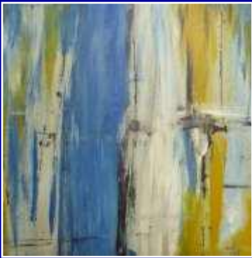
Mental Image #7 By Linda Haungs