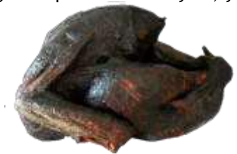
Vera's Thanksgiving Turkey

got rubbed, the temperature was perfect in the deep fryer. We were ready to go; the turkey was placed in the fryer with a thermometer to check the doneness. Once the turkey reached the right temperature and timing was right we removed it. To our horror the turkey was black. At first we couldn't figure out what had happened. We later found out that sugar will burn if the temperature exceeds 230 degrees—oops. All wasn't lost though—after peeling away the charred skin the turkey was quite delicious-yum, yum!!