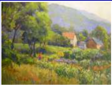
Hillside Garden by Kathleen Husted